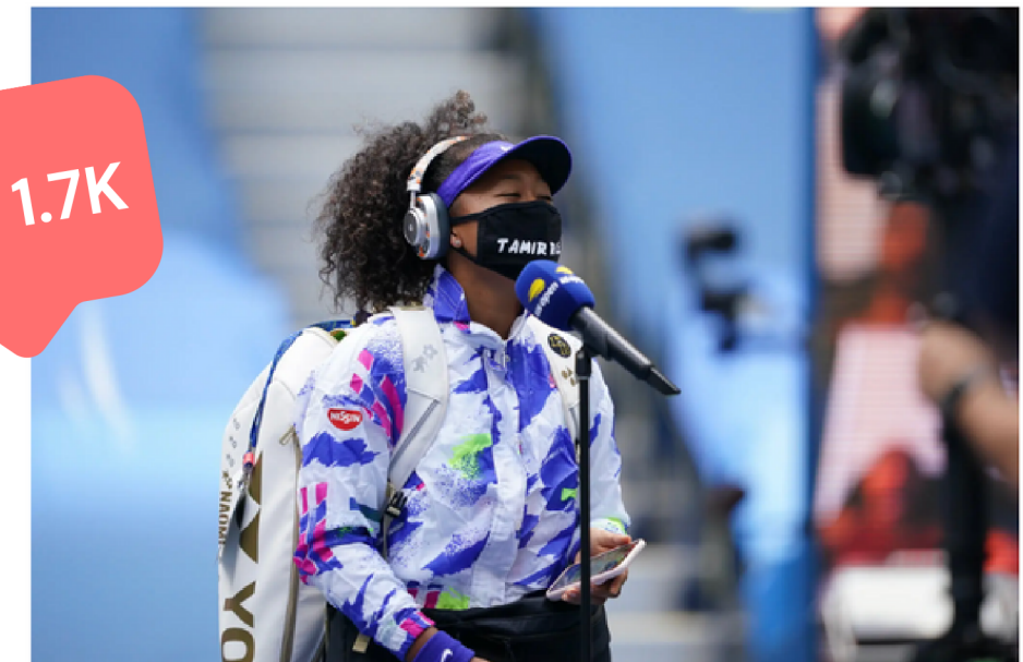
Naomi Osaka at the 2020 U.S. Open women's singles final wearing a mask bearing the name of Tamir Rice.